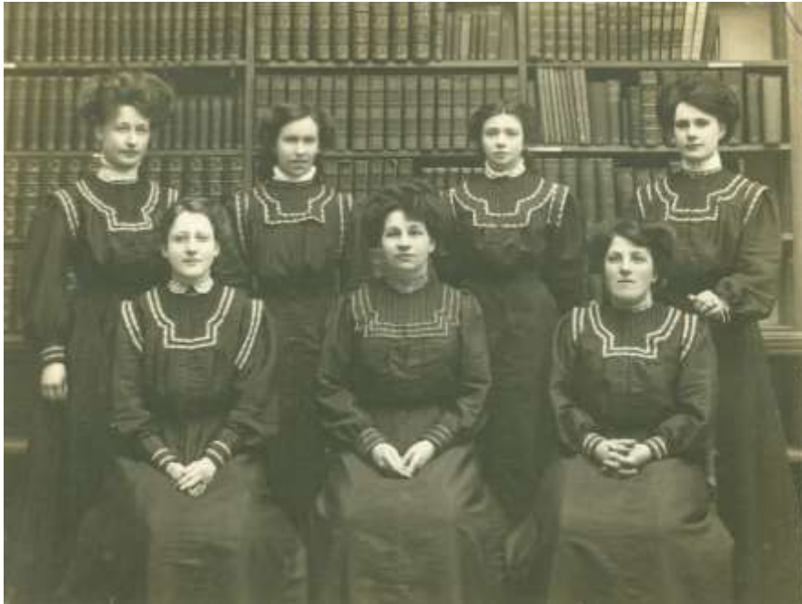
Worthing Library staff 1909