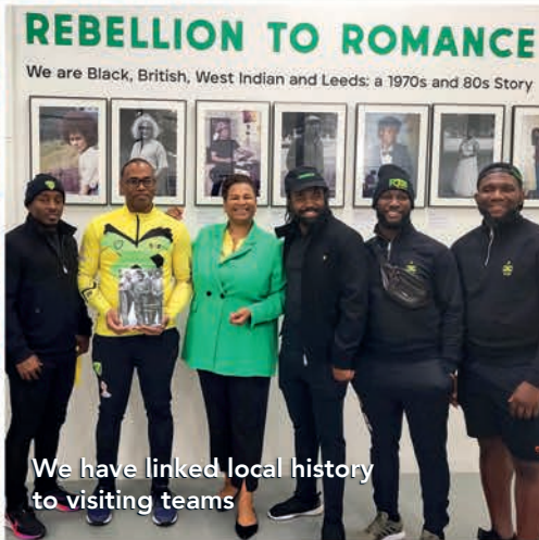
We have linked local history to visiting teams