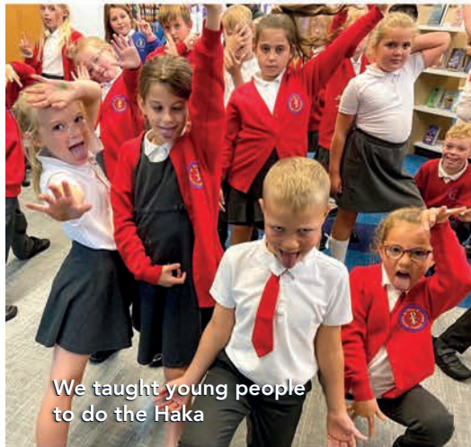
We taught young people to do the Haka

Over 12,500 PEOPLE listened into Forty20live podcasts about the RLWC21, made with a live audience at 11 panel events in different libraries across the regions.